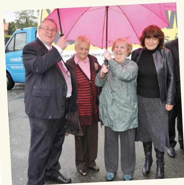
Labour Councillors at the Protect Your Property Launch held in October.

You asked for additional policing to address alcohol related anti-social behaviour - we brought in additional police officers and deployed them in known anti-social behaviour hotspots.