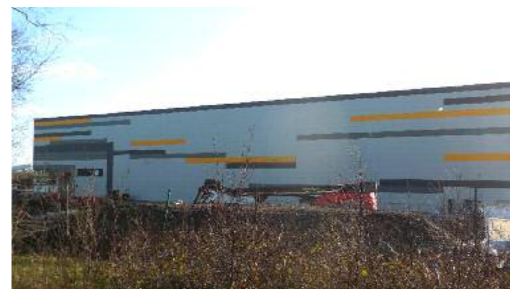
The first warehouse to be built for Port Salford

When the infrastructure is finished the building of Port Salford itself will be commenced, the build will also include a rail link which will help to reduce HGV traffic on the A57 when the port is operational.