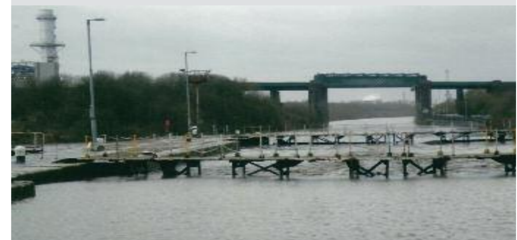
Irlam locks at the height of the floods

Agency, Peel Holdings and the City Council to establish why the flooding occurred and make certain that nothing similar occurs in the future.