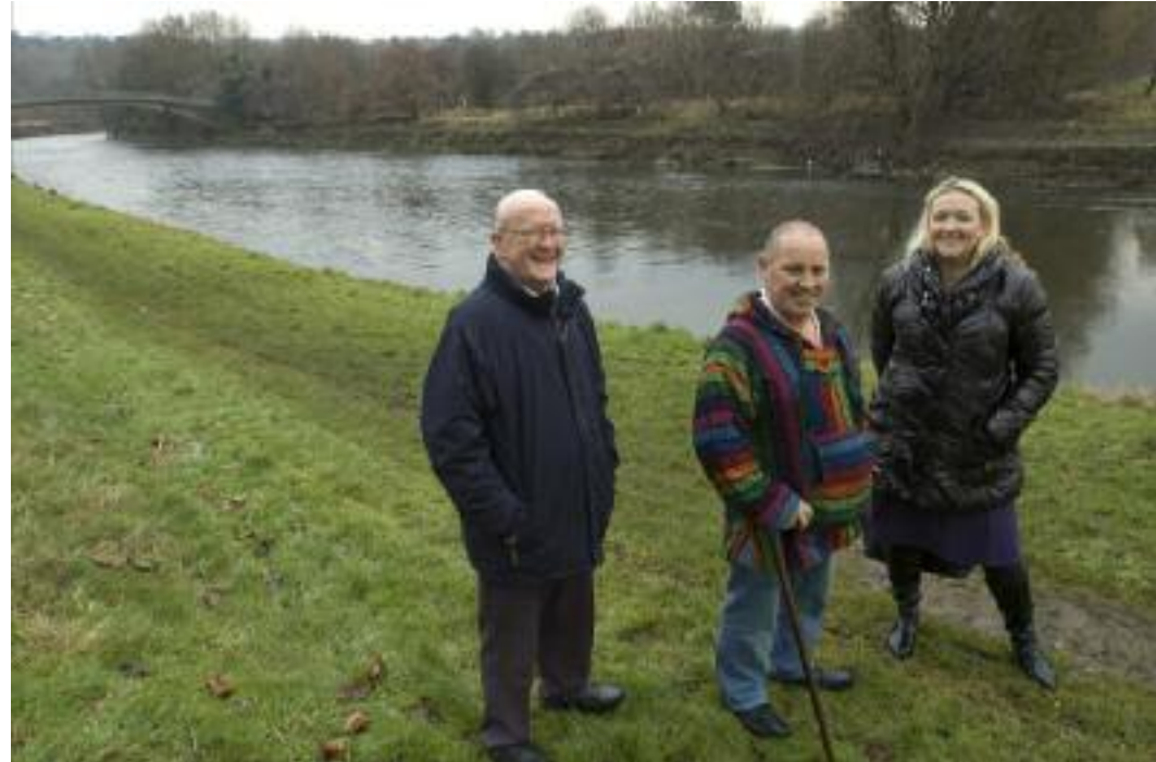
The environmental improvements and flood barrier in Kersal will include a nature and wetland area to support local fauna and attract wildlife.