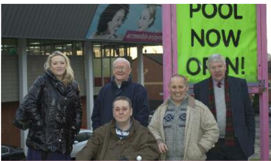
Graham Stringer MP with local councillors and labour supporters at the newly refurbished, and now open, swimming pool at Broughton.