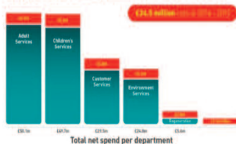
Budget cuts per department for 2014-2015

The City Mayor added: "The face of local government in Salford is being changed forever because of this Government's austerity policies.