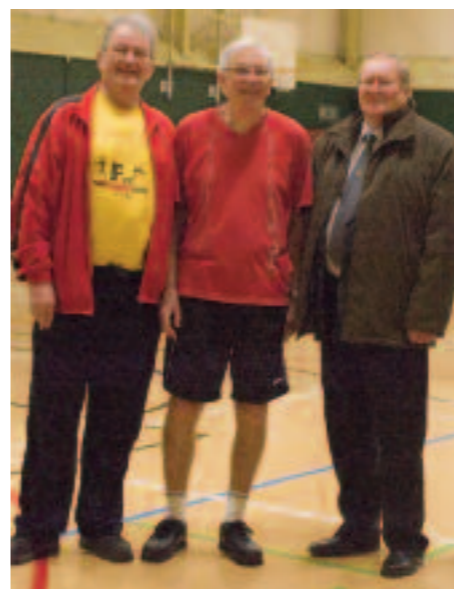
Pendlebury councillors in the sports hall