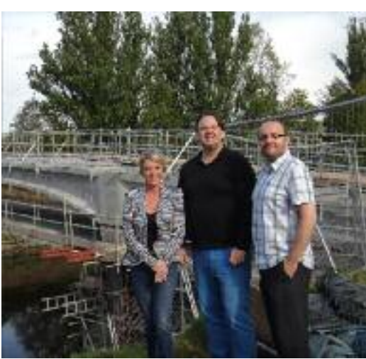
After major repairs including replacing the parapets, railings, and resurfacing the path, Broughton footbridge nears completion