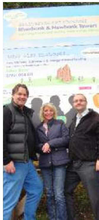
Decent homes improvements

Block improvements at Riverbank & Newbank Towers, Greengate. Two Salford tower blocks are undergoing a dramatic transformation as part of a multi-million pound development programme. Investment's of £6.6 million to overhaul Riverbank and Newbank Towers in Greengate, Salford.