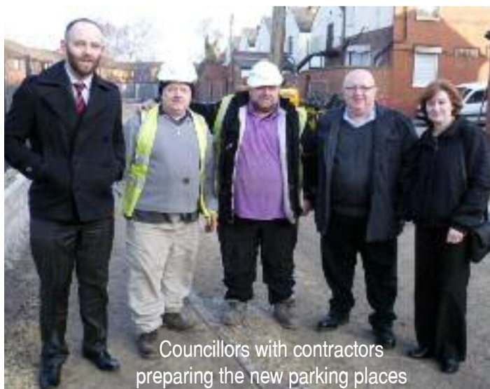
Councillors with contractors preparing the new parking places

Traders and local residents have welcomed the development which makes good use of land which has been neglected.