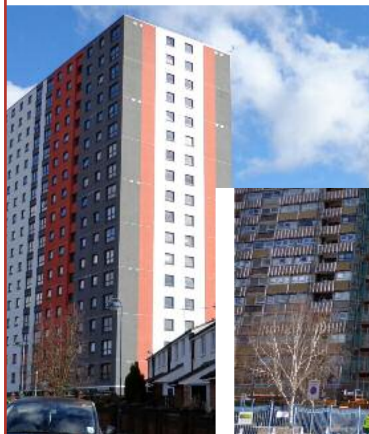
A reclad Nine Acre Court with ongoing work at both Canon Hussey and Arthur Millwood Courts.

Whole housing areas across the Ordsall estate, Islington estate and the Stowell estate have had internal work completed or it is currently ongoing, from new kitchens and bathrooms to heating systems. Your local Labour team will continue to urge the Government to commit funding to bring the decent homes improvements to all residents' homes.