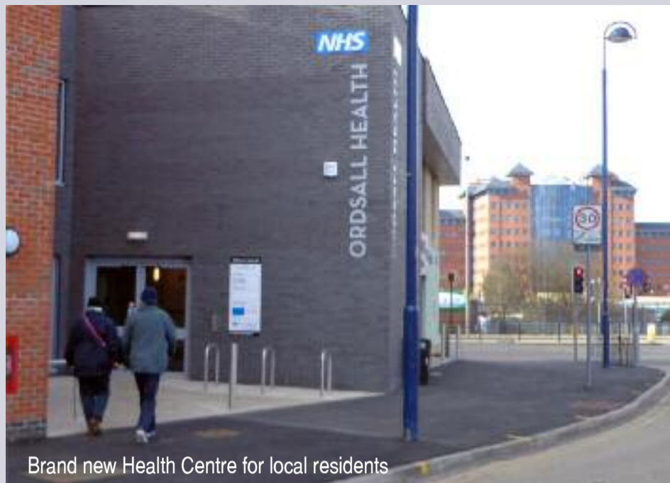
Brand new Health Centre for local residents

Despite the Government's cuts, The Labour Party keeps delivering for you across Ordsall.