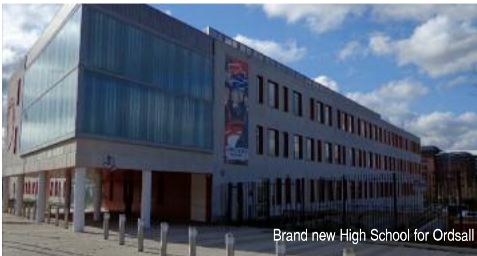
Brand new High School for Ordsall

This is the local Labour Party's commitment to driving up educational standards. We wanted world class teaching and learning facilities and a great physical asset for the wider community to come and use, and we have achieved just that.